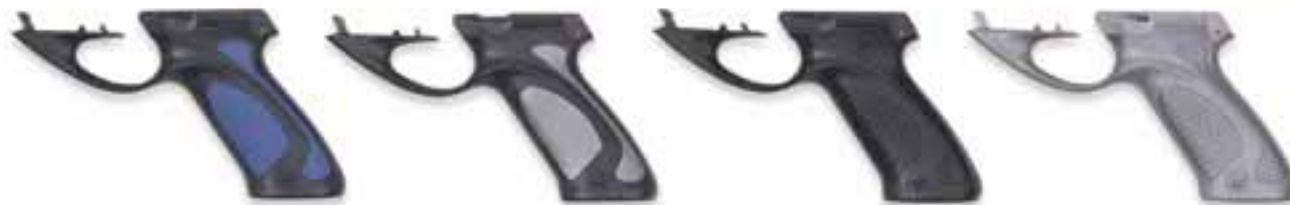
ACCESSORY GRIPS WITH RUBBER INLAYS UPGRADE TO THE DLX-STYLE GRIP FRAME WITH COMFORTABLE RUBBER INLAYS.