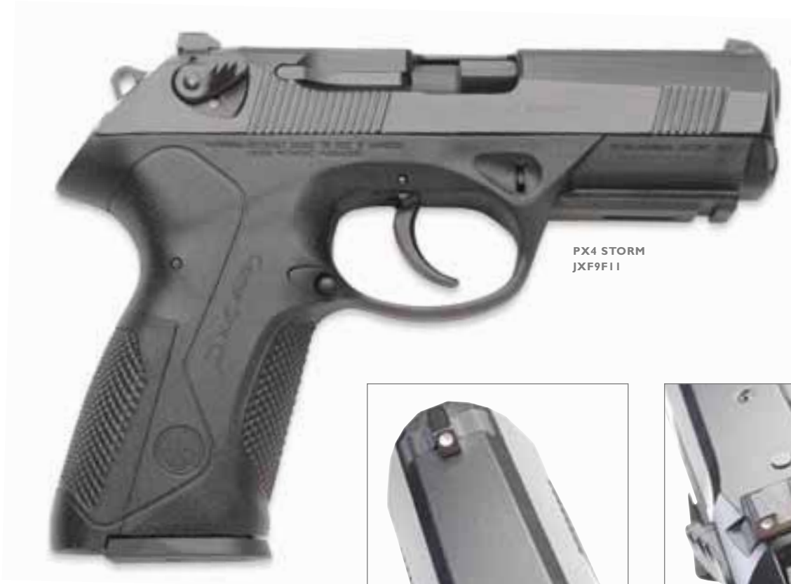
PX4 STORM JXF9F11