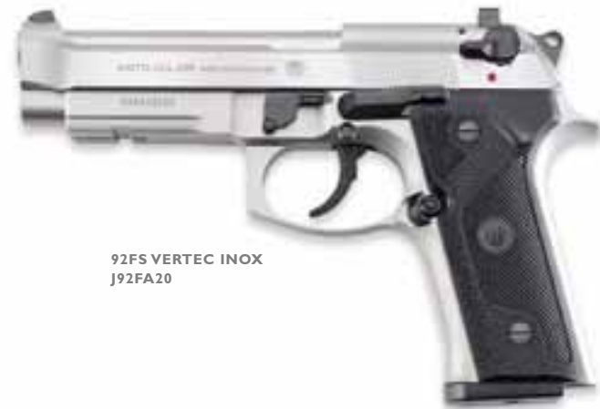
92FS VERTEC INOX J92FA20