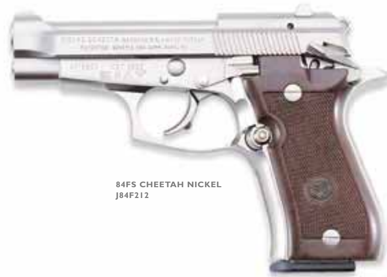
84FS CHEETAH NICKEL J84F212

While the 87 Cheetah is a lightweight pistol for field carry, the 87 Target is a heavyweight competition gun that will be at home on any range. It features both adjustable metallic sights and a Weaver-style rail for mounting scopes or red dot sights. A squared-off muzzle allows a steady ready position on the bench for practical or international standard pistol shooting. The single-action trigger is light and crisp for accurate off-hand firing. You can add the optional walnut grips from our Pro Shop line of products.