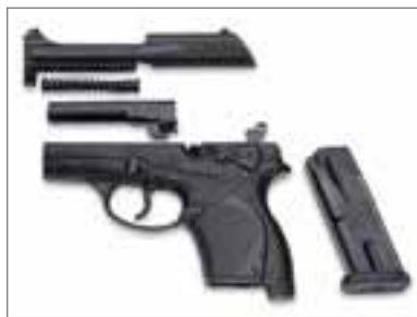
THE 9000S IS SIMPLE, ROBUST AND RELIABLE: THE HALLMARKS OF A PISTOL YOU CAN COUNT ON.

It will accept "pre-ban" 92/96 magazines for increased capacity (using optional adapter). An extendable magazine "bottom", that extends 1\frac{1}{32} " when the pistol is drawn and retracts when it is holstered, is included. (See Pistol Pro Shop section for details.)