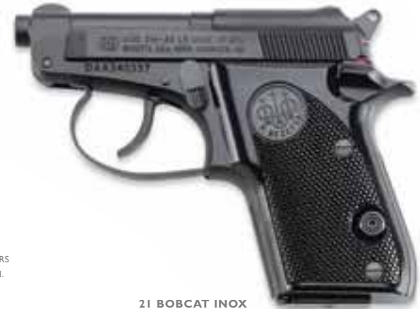
21 BOBCAT INOX J212104