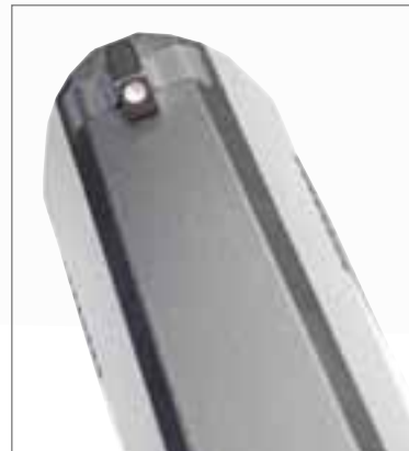
STANDARD SUPER-LUMINOVA SIGHTS GIVE HIGH TARGETING PERFORMANCE IN ALL TYPES OF LIGHT CONDITIONS. WITH MINIMAL EXPOSURE TO LIGHT (OR FLASHLIGHT), THIS LUMINOUS MATERIAL IS "CHARGED" AND VISIBLE IN LOW-LIGHT.