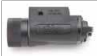
ITI M3 LIGHT (NOT INCLUDED)

Nothing reduces recoil like a little extra weight, and Beretta engineers added it to this full-race competition pistol by specifying a steel frame. When you combine a bit more heft with the M1911-style Vertec grip style, you have a soft-shooting 9mm or .40 S&W pistol that's ready for the range, right out of the box. Choose single- or double-action variants to match your shooting style.