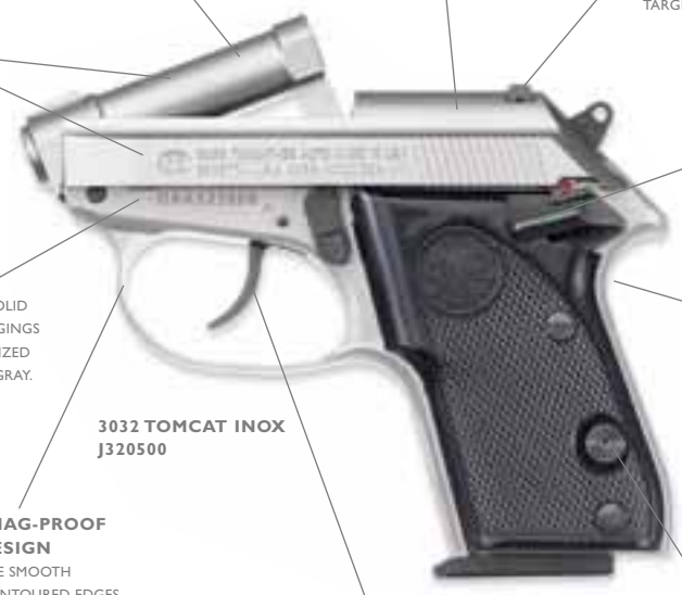
3032 TOMCAT INOX J320500

TRIGGER PULL SMOOTH, CRISP PULL IN DOUBLE/SINGLE ACTION.