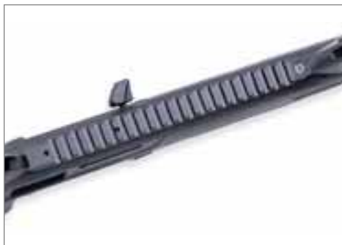
THE OPTIONAL PICATINNY (MIL-STD-1913) TOP RAIL ALLOWS EASY INSTALLATION OF DOT SIGHTS OR SCOPES.