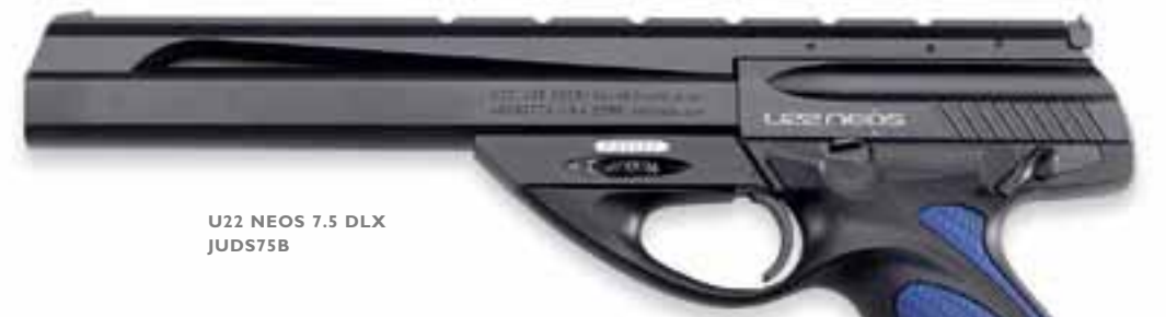
U22 NEOS 7.5 DLX JUDS75B