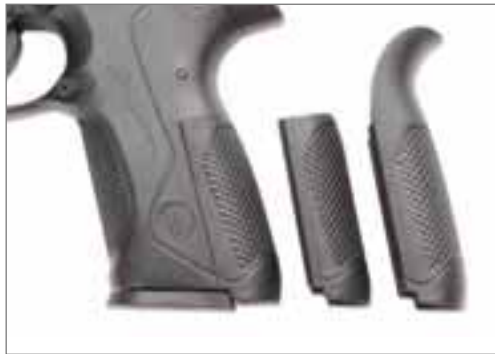
INTERCHANGEABLE GRIP BACKSTRAPS ALLOW FOR CUSTOMIZATION TO THE INDIVIDUAL'S HAND SIZE. MEDIUM COMES STANDARD ON THE GUN, WHILE SMALL AND LARGE ARE INCLUDED IN THE BOX FOR EASY MODIFICATION.

Thanks to these options, the same powerful and reliable handgun can be adapted to fit diverse needs and uses.