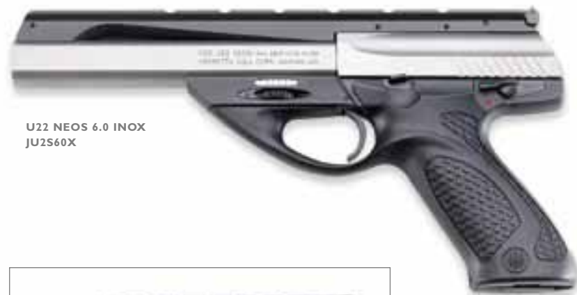
U22 NEOS 6.0 INOX JU2S60X