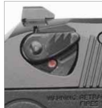
SAFETY/DECOCKER LEVER GEOMETRY PREVENTS ACCIDENTAL ENGAGEMENT OR DISENGAGEMENT WHEN RETRACTING SLIDE.