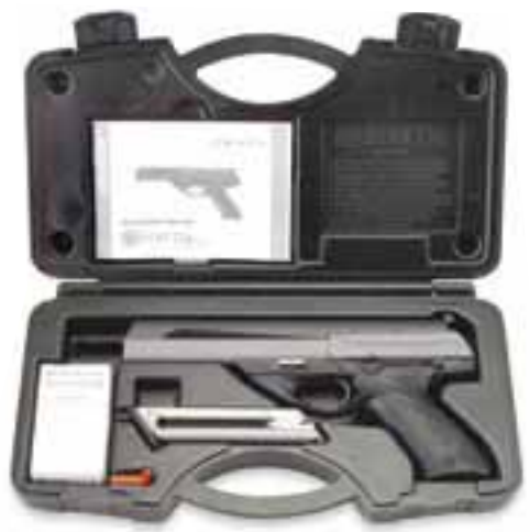
A HIGH-IMPACT CARRYING AND STORAGE CASE IS SUPPLIED WITH EACH NEOS.