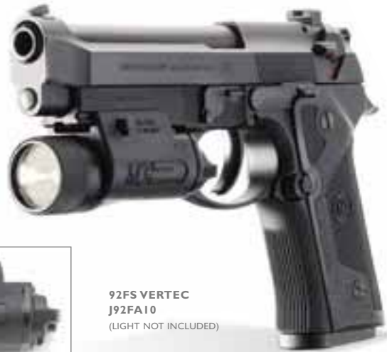
92FS VERTEC J92FA10 (LIGHT NOT INCLUDED)