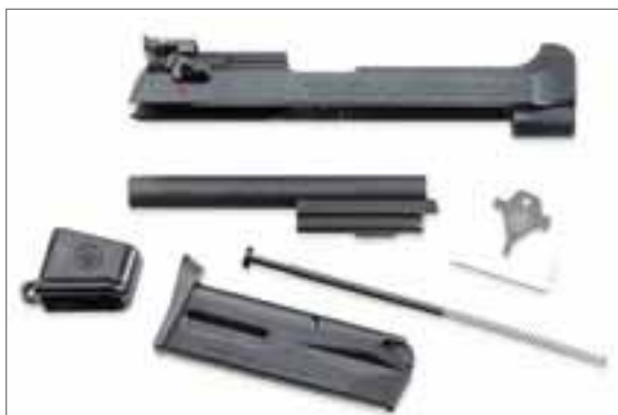
22LR PRACTICE KIT J9022PK BUILD YOUR SHOOTING SKILLS WITH THE OPTIONAL .22 CONVERSION KIT FOR THE 92/96 PISTOLS. IT'S EASILY INSTALLED AND REMOVED.

Both are available with the heavier, recoil-reducing Brigadier slide and in blue or Inox finishes. It's even easier to master your Beretta when you add the 22LR Practice kit, which adapts the 92 or 96 pistols to fire inexpensive .22 Long Rifle ammunition.