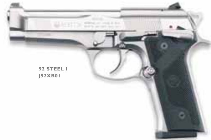
92 STEEL I J92XB01