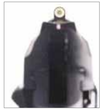
PROMINENT TRITIUM-FILLED SIGHTS GIVE THE TOMCAT TRITIUM A BOLD SIGHT PICTURE IN LOW-LIGHT CONDITIONS.

TIP-UP BARREL OFFERS QUICK, DIRECT CHAMBER LOADING AND UNLOADING WITHOUT WORKING THE SLIDE. THIS MAKES THE TOMCAT IDEAL FOR BEGINNERS AND ELDERLY SHOOTERS WHO LACK THE STRENGTH TO RETRACT THE SLIDE MANUALLY.