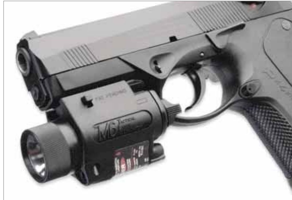
MIL-STD-1913 "PICATINNY" STANDARD ACCESSORY RAIL. ALLOWS MOUNTING OF OPTIONAL TACTICAL LIGHTS AND LASER UNITS.