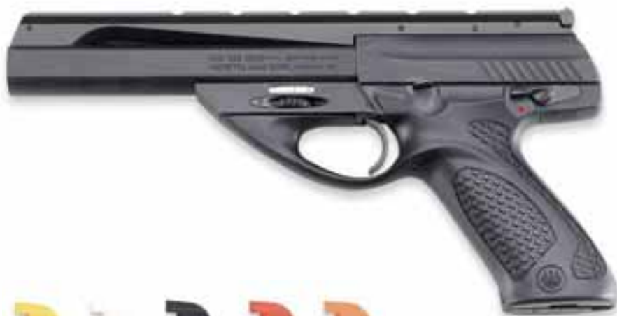
U22 NEOS MODULAR SYSTEM BARRELS, SIGHTS, AND GRIP FRAMES EASILY INTERCHANGE TO PERSONALIZE YOUR PISTOL.

Weaver-style rings for easy scope mounting. Changing barrels doesn't mean rezeroing, either: both front and rear sights are fixed to the integral rail and stay with the barrel. Neos is a pistol that can grow and change to fit your shooting interests, from plinking to small game hunting to competition.