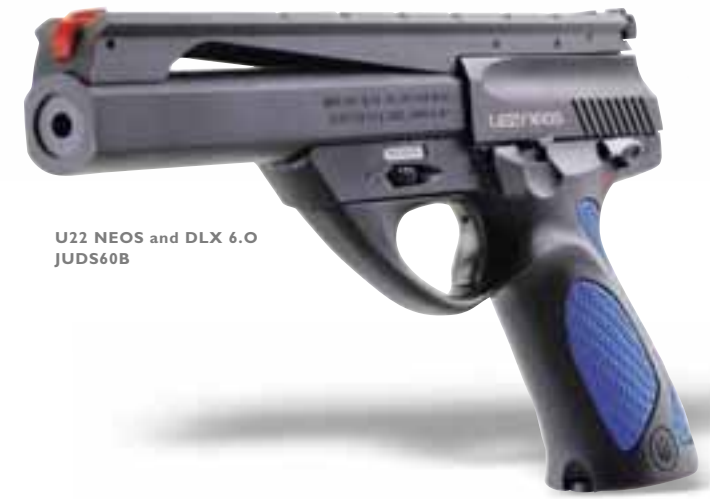
U22 NEOS and DLX 6.0 JUDS60B