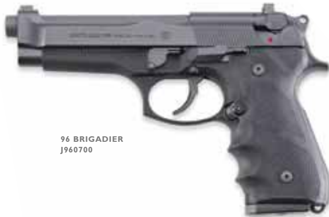
96 BRIGADIER J960700