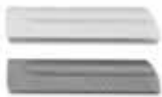
ACCESSORY SLIDE ASSEMBLY CHOOSE A BLUED OR INOX SLIDE.