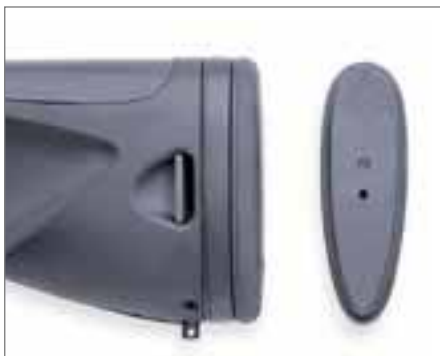
ADJUST PULL LENGTH TO YOUR SPECIFICATIONS WITH SUPPLIED SPACER. (TWO MORE SPACERS MAY BE ADDED AND REMOVED)