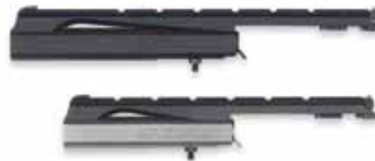
ACCESSORY BARREL ASSEMBLY CHOOSE FROM THREE BARREL LENGTHS, ALL FITTED WITH ACCESSORY RAILS THAT ACCEPT WEAVER-STYLE RINGS.