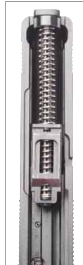
THE PX4 FEATURES A CAPTIVE RECOIL SPRING ASSEMBLY WITH INTEGRATED RECOIL BUFFER. THESE FEATURES HELP REDUCE FELT RECOIL AND MINIMIZE MUZZLE RISE.