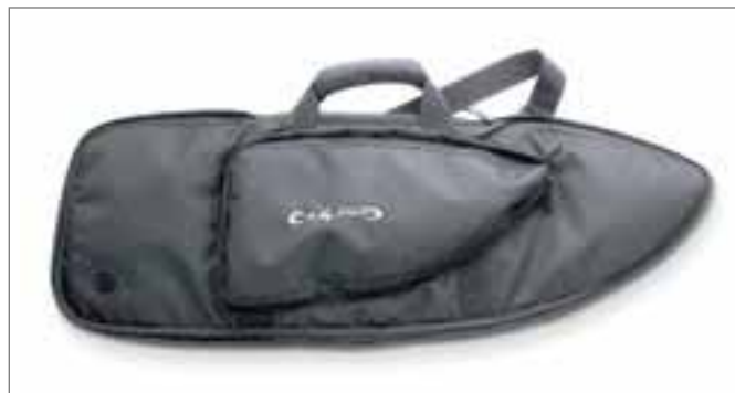
THE OPTIONAL CARRYING CASE PROTECTS THE CX4 FROM THE ELEMENTS.