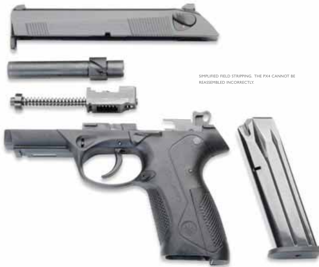
SIMPLIFIED FIELD STRIPPING. THE PX4 CANNOT BE REASSEMBLED INCORRECTLY.