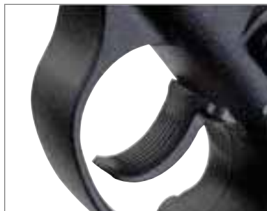
EXPERTS PREFER A DOUBLE-ACTION TRIGGER IN A PISTOL DESIGNED FOR CONCEALED CARRY.