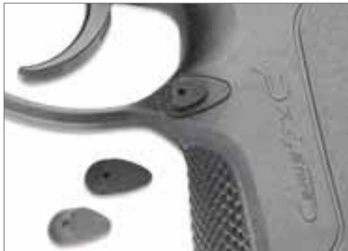
MULTIPLE-SIZED, REVERSIBLE MAGAZINE RELEASE BUTTONS ALLOW FOR CUSTOMIZATION TO THE INDIVIDUAL'S HAND SIZE. SMALL SIZE COMES STANDARD ON THE GUN, WHILE MEDIUM AND LARGE BUTTONS ARE INCLUDED IN THE BOX FOR EASILY REPLACEMENT. EACH SIZE CAN BE POSITIONED FOR RIGHT-HANDED OR LEFT-HANDED USE.