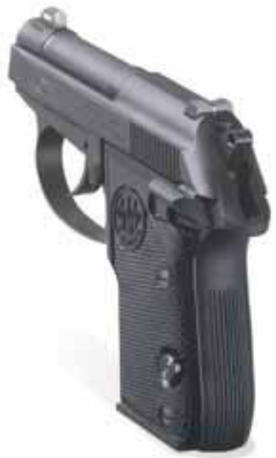
3032 TOMCAT TRITIUM J320105