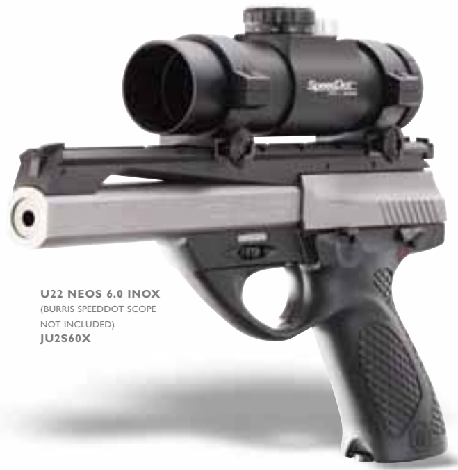
U22 NEOS 6.0 INOX (BURRIS SPEEDDOT SCOPE NOT INCLUDED) JU2S60X

version) soft rubber grip inserts. An aggressive grip molding pattern makes the grasp secure when match pressure gives even the seasoned competitor moist palms. Select the standard 6" barrel or specify the extra sight radius of the 7½" barrel.