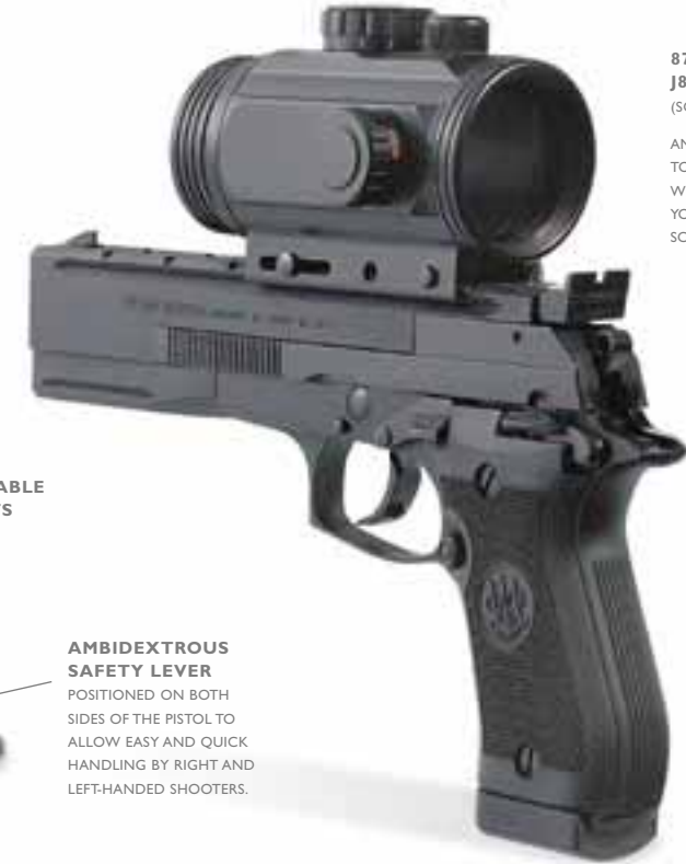
87 TARGET J87T010 (SCOPE NOT INCLUDED) AN INTEGRAL TOP RAIL ACCEPTS WEAVER-STYLE RINGS. YOU'LL EASILY MOUNT SCOPES OR DOT SIGHTS.

FINISHING THE MATTE-BLACK FINISH IS OBTAINED THROUGH SAND BLASTING AND ANODIZING OF THE LIGHT ALUMINUM ALLOY PARTS OR BLUING OF THE STEEL COMPONENTS.