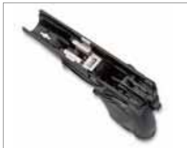
THE POLYMER FRAME MAKES THE 9000S BOTH COMFORTABLE TO SHOOT AND RESISTANT TO CORROSION AND WEAR.