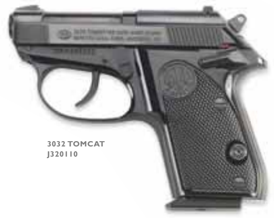
3032 TOMCAT J320110