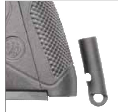
FLUSH AND OPTIONAL LANYARD HAMMER SPRING CAPS, ALLOW FOR THE USE OF TACTICAL RETENTION LANYARD.