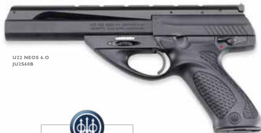
U22 NEOS 6.0 JU2S60B