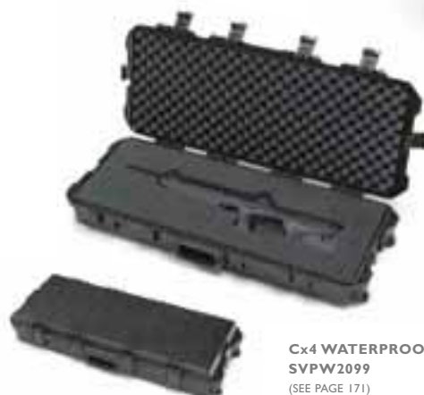
Cx4 WATERPROOF CASE 36" SVPW2099 (SEE PAGE 171)