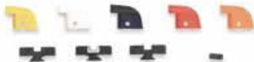
ACCESSORY REAR AND FRONT SIGHTS SELECT THE RIGHT SIGHT COLOR FOR THE TARGET: BLACK, RED OR WHITE. BOTH FRONT AND REAR SIGHTS ARE REPLACEABLE.