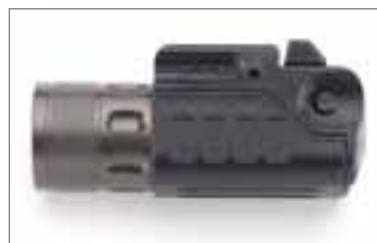
SURE FIRE NITROLON LIGHT (NOT INCLUDED)