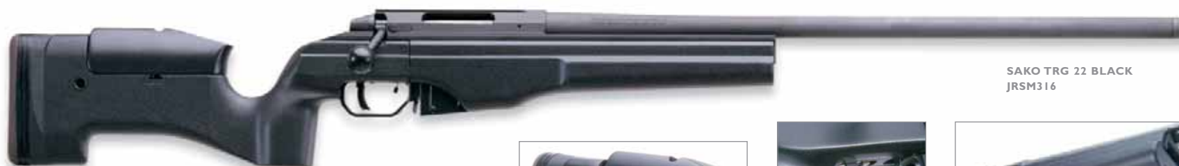
SAKO TRG 22 BLACK JRSM316