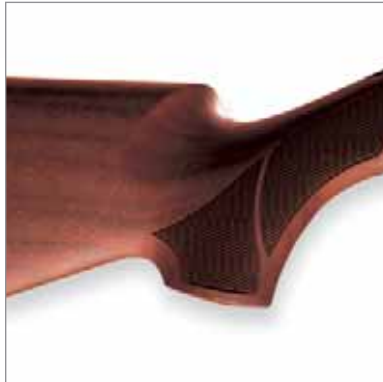
HIGH-GRADE WALNUT STOCK