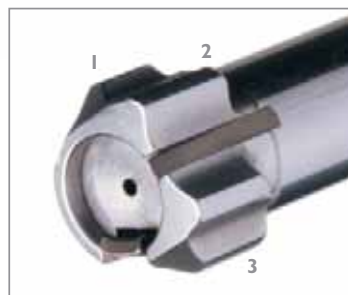
PRECISION BOLT WITH THREE LOCKING LUGS.