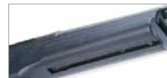
COMPETITION-STYLE SLING-SWIVEL RAIL; ATTACHMENT FOR ALL-STEEL BIPOD