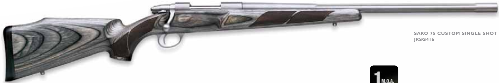
SAKO 75 CUSTOM SINGLE SHOT JRSG416

The trigger is of the single set type. If pushed forward, it "sets" to be released with a super-light 7.5 oz pressure.