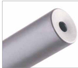
A RECESSED TARGET-STYLE CROWN PROTECTS RIFLING AND THE BARREL'S ACCURACY.