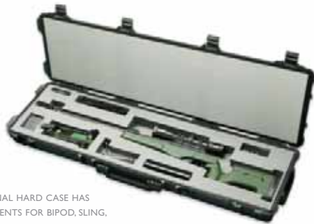
AN OPTIONAL HARD CASE HAS COMPARTMENTS FOR BIPOD, SLING, CLEANING KIT AND OTHER ACCESSORIES.