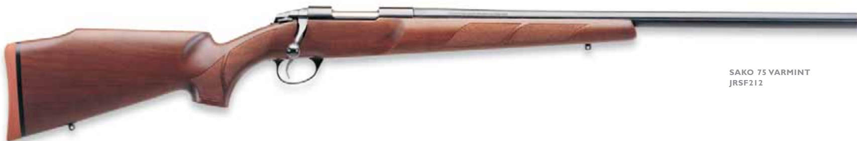
SAKO 75 VARMINT JRSF212

Our set trigger is incredibly safe. If once you have set it you wish to return it to normal pull mode, all you have to do is engage the safety or lift the bolt: this will “unset” the trigger and make it safe for you to unload the rifle.