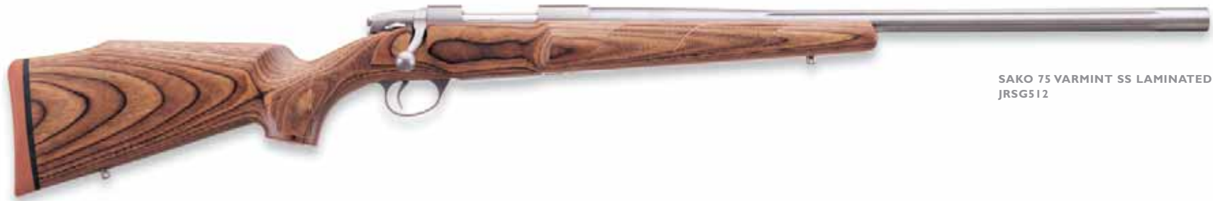
SAKO 75 VARMIT SS LAMINATED JRSG512

all the benefits of composite polymers with the warmth and looks of wood. Also, the stock features a true varmint-style beavertail fore-end for maximum shooting stability. This is one of the most attractive and accurate rifles in our lineup – now more than ever.