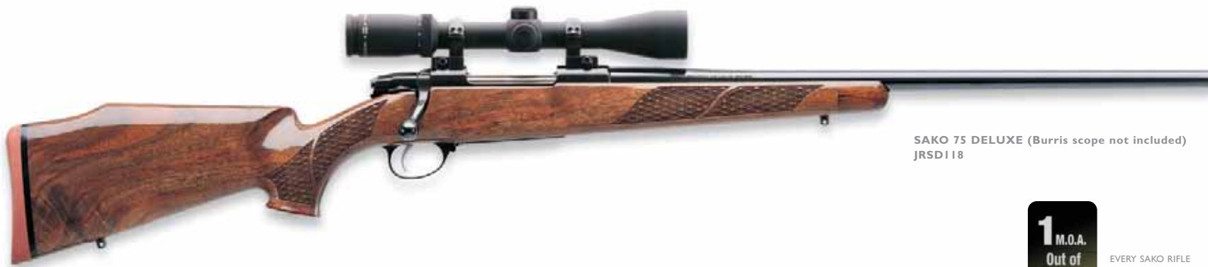
SAKO 75 DELUXE (Burris scope not included) JRSD118

The barreled action's tough, forged metal is finished with a deep classic blue that is as attractive as it is long-lasting and durable. The gloss-finish stock is made of select-quality walnut, and it features a traditional rosewood fore-end tip and grip-cap. The buttplate is made of the same red rubber that has graced premium rifles for over a century. Other traditional features include game-engraved hinged floorplate.