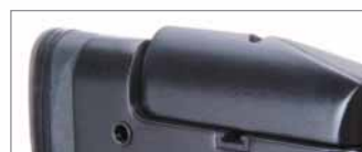
ADJUSTABLE STOCK CHEEKPIECE