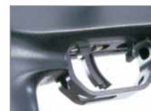
FULLY ADJUSTABLE COMPETITION-STYLE, 2-STAGE TRIGGER; SAFETY HOUSED IN TRIGGER GUARD