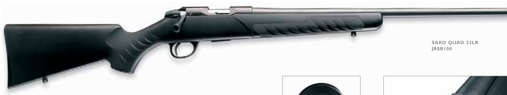
SAKO QUAD 22LR JRSR100

THE MUZZLE FEATURES A CONCAVE HAND-TURNED RECESSED CROWN FOR OPTIMUM ACCURACY-RETENTION.