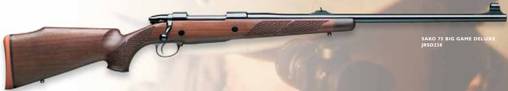
SAKO 75 BIG GAME DELUXE JRSD238

As with all Sako 75 rifles, the Deluxe is tested to shoot groups of 1 inch or less prior to shipping it to our valued customers.