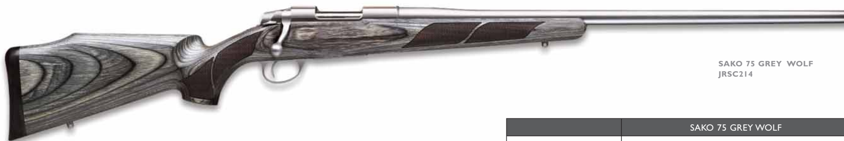
SAKO 75 GREY WOLF JRSC214

As with all Sako 75 models, the Grey Wolf features a match-grade, cold-hammerforged barrel free-floated and hand-crowned at the muzzle. The trigger is adjustable from 2 to 4 lbs for maximum shooting comfort and accuracy, and the stainless-steel magazine is detachable. Available in the four smallest action sizes – I, III, IV and SM.