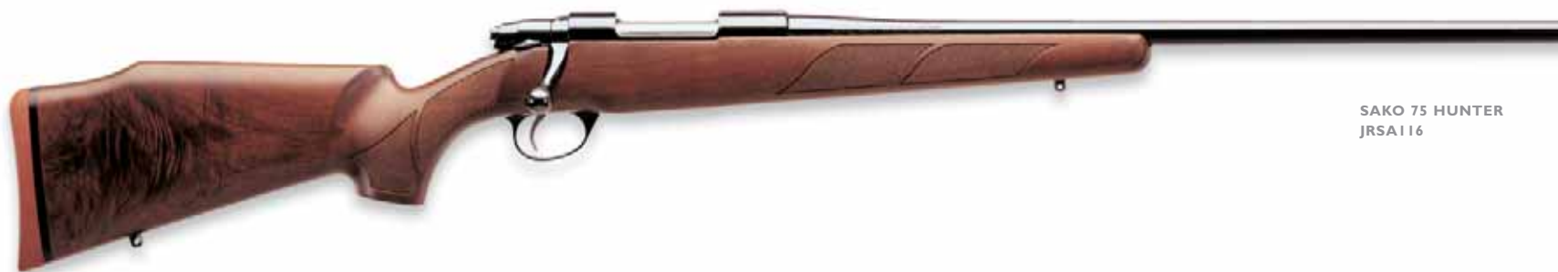
SAKO 75 HUNTER JRSA116

the short bolt lift made possible by three locking lugs means there's no wasted motion in getting a follow-up shot. And with an action properly scaled to your chosen cartridge, you're not carrying any more rifle than you need — your shoulder will notice the difference at the end of a long hunting day.