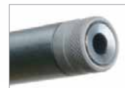
MUZZLE IS THREADED FOR BRAKE.