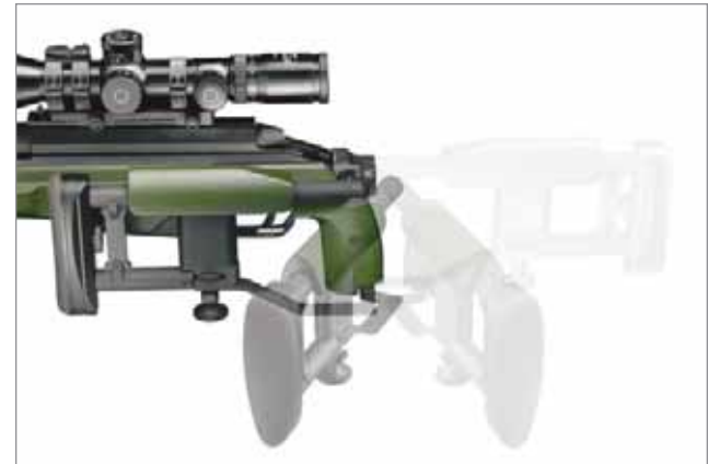
NEW TRG 22 WITH FOLDING