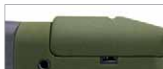
ADJUSTABLE STOCK CHEEKPIECE