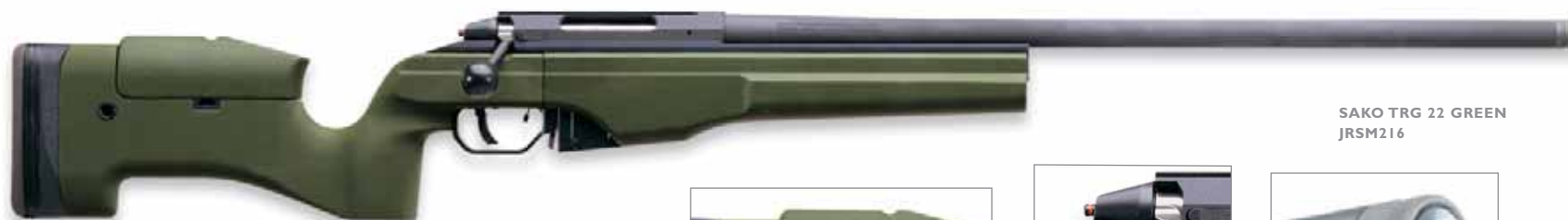
SAKO TRG 22 GREEN JRSM216

to tailor the TRG to your build. To complement the Sako TRG series a variety of accessories of the highest quality are available, such as muzzlebrake, bipod, mirage-sling, etc. Please see our accessories section for a complete list.