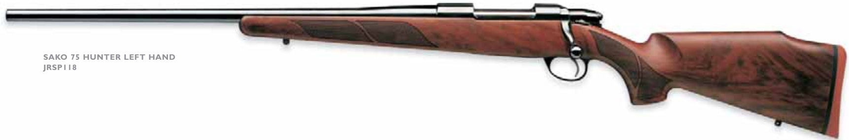
SAKO 75 HUNTER LEFT HAND JRSP118

For years, left-handers could only look in envy at right-handed Sako owners. No more! The Sako 75 now is available in a true left-hand version. Three popular calibers, .25-06, .270 Win and .30-06 give the lefty the rifle he needs for everything from antelope to elk.