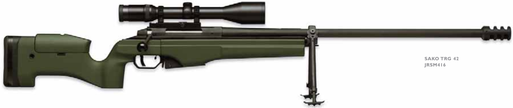
SAKO TRG 42 JRSM416

to your specifications, and a detachable magazine makes reloads fast and sure. When you bring the TRG 42, you're ready for anything.