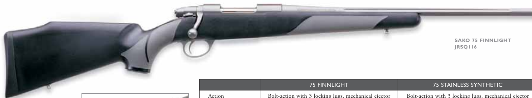
SAKO 75 FINNLIGHT JRSQ116

AT SAKO, WHEN WE CALL A RIFLE "STAINLESS", WE REALLY MEAN "STAINLESS". UNLIKE OUR COMPETITORS, WE MAKE EVEN THE INSIDE COMPONENTS OF THE ACTION STAINLESS, NOT JUST THE BARREL AND A FEW ACTION PARTS. THE DURABILITY THIS AFFORDS OUR RIFLES IS A TRUE ASSET FOR DEMANDING HUNTERS, AND IT IS YET ONE MORE REASON WHY SAKO RIFLES ARE RIGHTFULLY CONSIDERED PARAGONS OF UTILITY AND ENGINEERING INNOVATION.