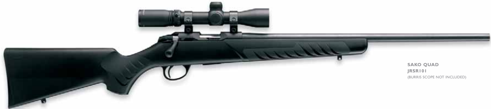
SAKO QUAD JRSR101 (BURRIS SCOPE NOT INCLUDED)

The action is a brand-new Sako Rimfire action, with a 50-degree bolt-lift. It is designed to blend with the stock as one – flowing lines that will please the traditionalist and innovator alike. The quick-detachable 5-shot magazine comes in two versions: one for the 22LR and 17 Mach 2, the other for the 22 WMR and the 17 HMR. The stock is fiberglass-reinforced polypropylene, featuring new Giugiaro styling, ambidextrous palm-swell and an adjustable butt-pad system.